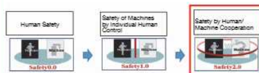
Fig. 1 Outline of Cooperative Safety

※ Ref. Masao Mudoaidono, "Safety and Assurance for the New Era: Safety 2.0 and Cooperative Safety," Hitotsubashi Business Review 2019 WIN, pp.8-17, Toyo Keizai Inc. (Dec. 2019).